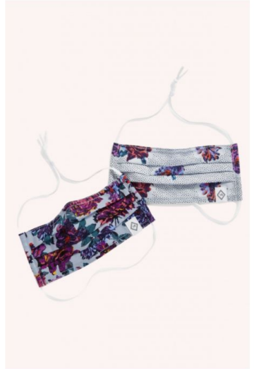
Vera Bradley Pleated Mask – 2 Pack shop now