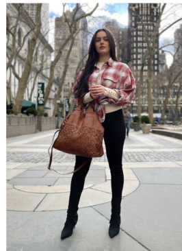
Rina Tote by Bolsa Nova