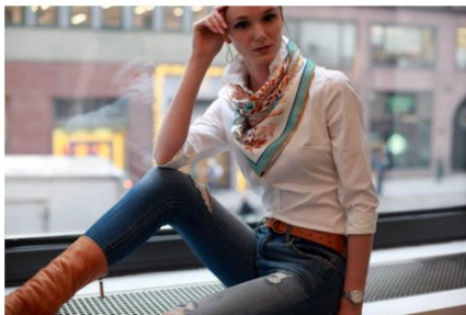
Silk Scarf of the Autumn