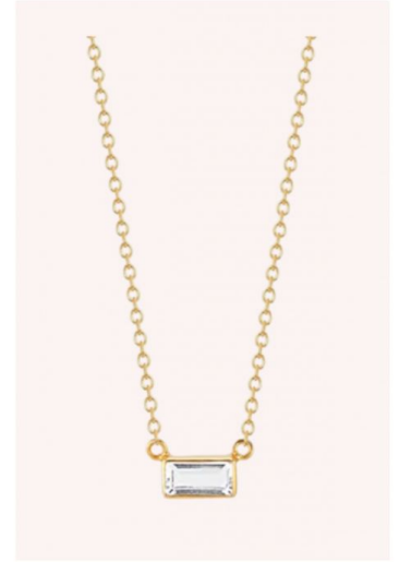
Elli Parr Bobbi Baguette Necklace

Searching through Amazon's website is 99% of the challenge when it comes to gifting so I have curated an Amazon Prime gift guide that will cover absolutely everybody on your list.