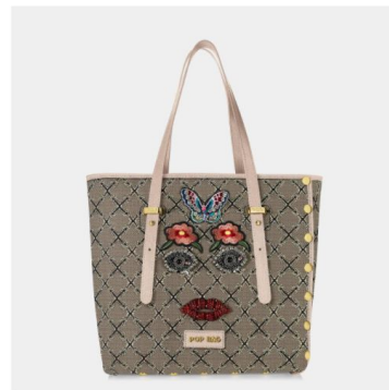
Pop Frida Tote

Tuscany-produced Pop Bag offers handbags that you can design yourself with snaps to change out the front or back panels to create your own unique style. Very innovative and versatile, one can select purse size, genuine Italian leather and croc-embossed finishes, handles, straps and interiors. The online custom product builder makes it super easy to be as creative as you like.