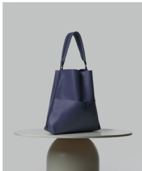
Iconic Slim M Tote by Callisto Crafts