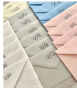
Luxury Scribe Original Crown Mill Gift Pack