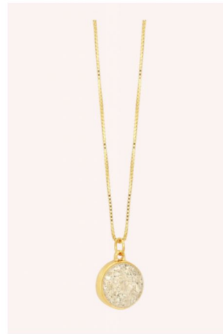
Dune Jewelry Sandglobe Necklace Custom Created with Sand from Your Favorite Travel Destination shop now

Don't worry these are not just your average personalized gifts. I have found everything from a completely customizable and personalized men's custom dress shirt to a necklace with the moon phase of the date you select.