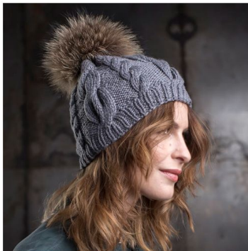
Julie Knitted Cashmere Hat