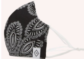
Vera Bradley Fitted Mask with Adjusters shop now