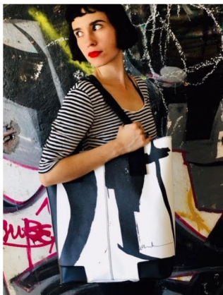
Black Line Crazy Collection

Tuscany-produced Pop Bag offers handbags that you can design yourself with snaps to change out the front or back panels to create your own unique style. Very innovative and versatile, one can select purse size, genuine Italian leather and croc-embossed finishes, handles, straps and interiors. The online custom product builder makes it super easy to be as creative as you like.