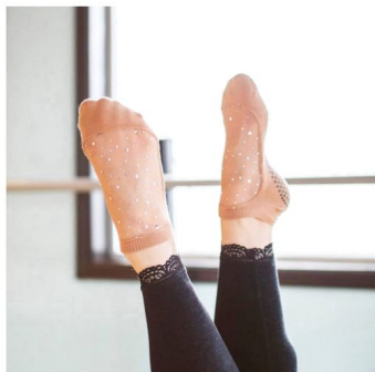
Shashi Sparkle Mesh Socks

The cutest stocking stuffers around are the Sparkle Mesh Grip Socks by Shashi , a stylish brand created for dance, pilates and yoga, but can be enjoyed by all.