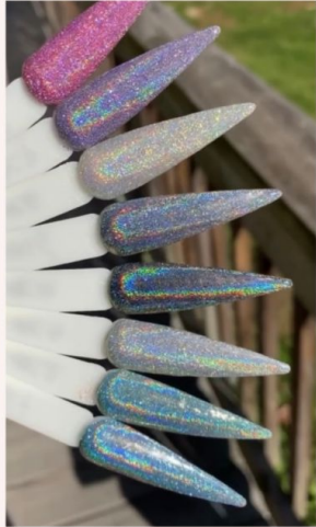
Revel Nail Complete Holo Chrome Dip Powder Collection shop now

Needing something within two days? I've got you covered there too! Check out my Amazon Prime Gifts for Everybody on Your List .