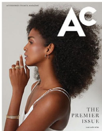
The cover of the premier issue of AC Magazine.

Rebranded as AC magazine, the publication is being chartered by the Accessories Council.