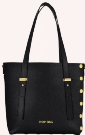
Pop Bag Saffy Tote shop now

But don't worry, I've got you covered. Not only will these gift ideas eliminate the stress of buying mom that perfect present it will also help you keep your rank as the favorite child.