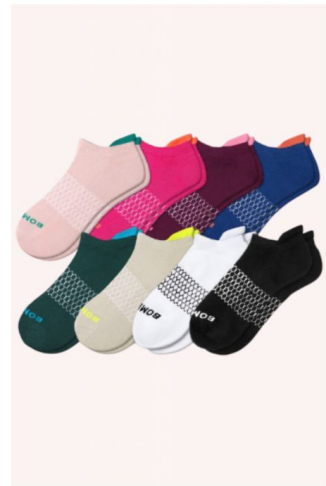
Bombas Solid Ankle Socks 8-Pack

We are all spending a little more time indoors these days so why not give the gift of cozy this year? Whether you are shopping for your bestie, your sister , or even a co-worker I've curated a list of twelve cozy gifts everyone needs right now!