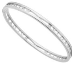
Luxury houses like Cartier and Bulgari, whose B.zero1 white gold bracelet is pictured, have also scaled down, in part to reach younger buyers.